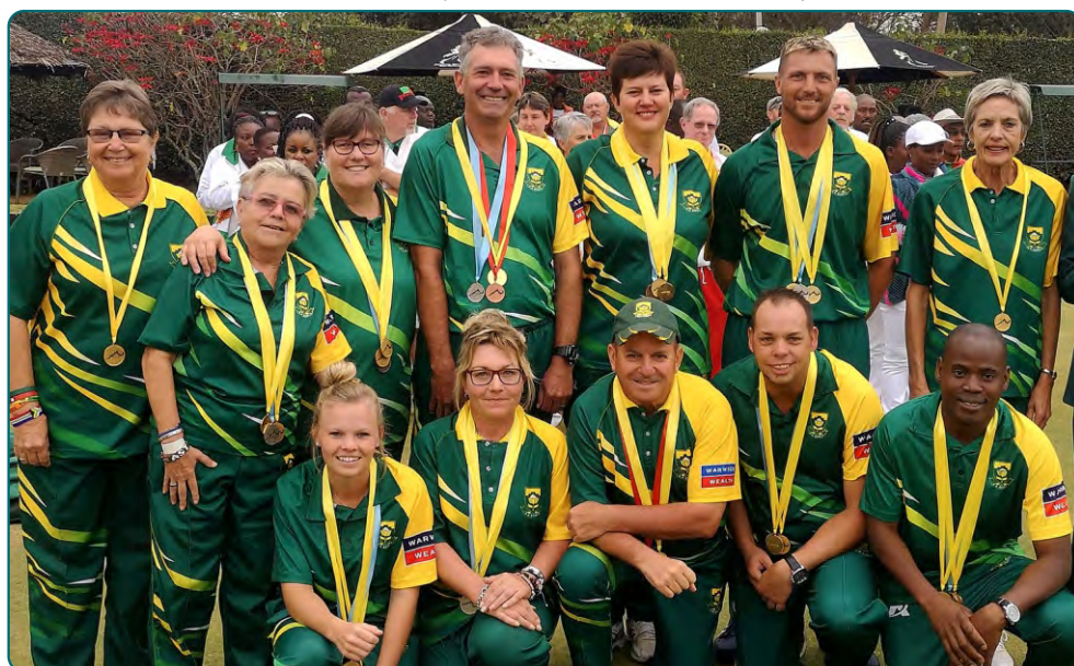
TEAM SOUTH AFRICA: Sporting medals galore