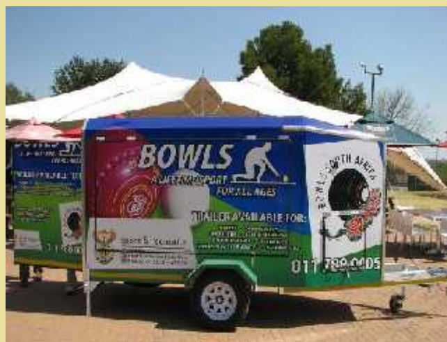
ALL READY: The spectacular development trailer

Each district is asked to supply details of suitable events