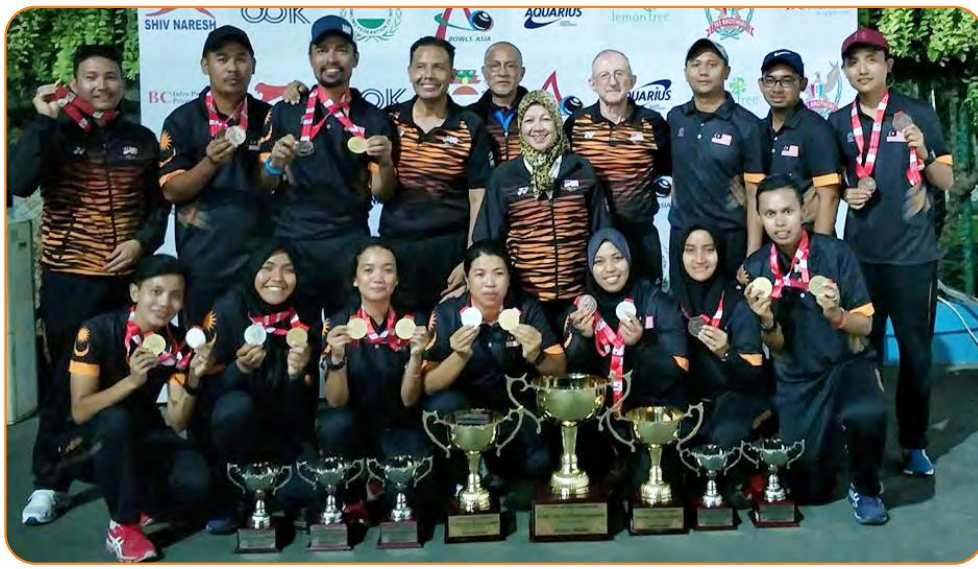
GRR: The triumphant Malaysian Tigers after their medal haul at this month's Asian Bowls Championships in New Delhi.

The formidable Malaysian team snared five of a possible eight senior gold medals at the 12th Asian Lawn Bowls Championships in India.