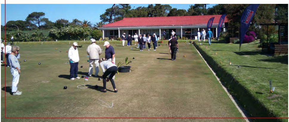
BUSY TIME: On the go at Meadowridge

Have you ever heard of, let alone played, Bolf? This enterprising Warwick Wealth-sponsored development intervention combination of golf and bowls was played at Meadowridge BC, Cape Town in September, writes Warwick Wealth's Sandy Street. Two greens were converted into an 18-hole links, including bunkers, water hazards and out-of-bounds markers. There was a shotgun start with a half-way house. Great fun was had by all, which concluded with a very different prize giving - most of the 80 competitors won something.