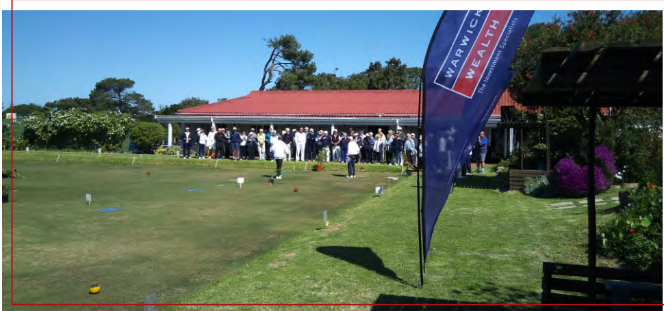
LIKE THIS: Instruction time for newbies