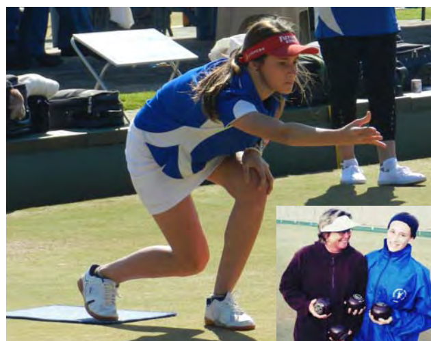
Just look at the concentration and well-balanced body-position!

RNSWBA (2016) Lawn Bowls Playing as a Team http://assets.imgstg.com/assets/console/document/documents/Playing_As_A_Team1.pdf Accessed 2016-10-12.