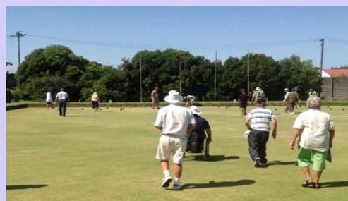
SUNNY DAY: Fun in the sun at East London BC