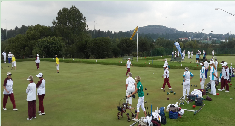
BUSY GREEN: Play goes on apace at Colbyn