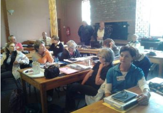
Classroom at Outeniqua B. C. George

Two successful Level 2 coaches' courses were held – one in George in November, 2014 and another in Johannesburg in January, 2015. The final results are not yet known, but are expected to be satisfactory.