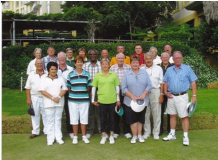
On the green at Wanderers B C, Johannesburg