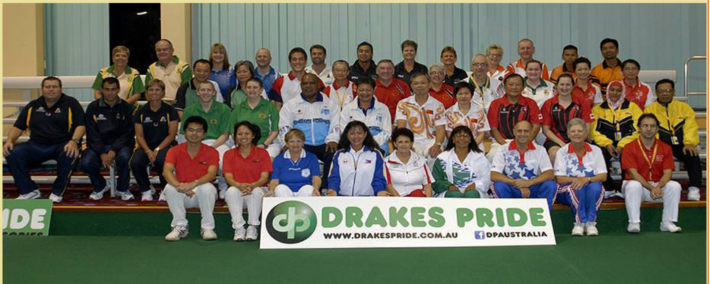
WORLD BEST: The colourful Indoor Championship field before the event; SA's Protea are top left

On Day 3 Piketh took control of her section with a stunning vic-