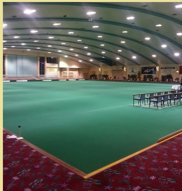
THE VENUE: The "dreaded" indoor lightening quick mat scene at Warwilla

So no medal glory, but everything else ... bring on the Commonwealth games, both are in their final squads, both have left calling cards.