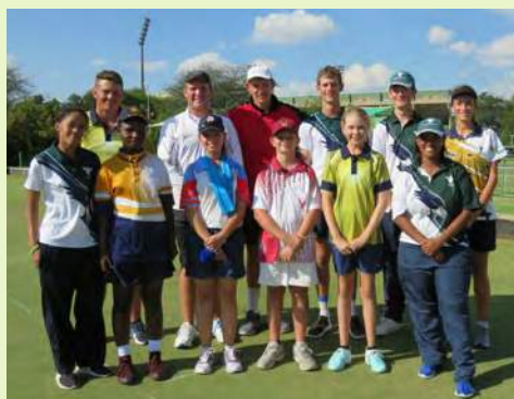
Seen in photo above at the back