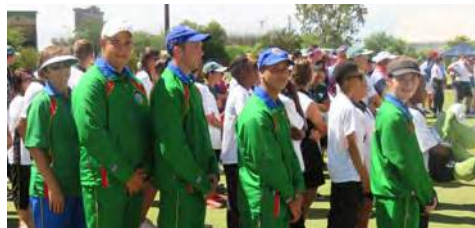
The U/20 team from Namibia (left) and the winning teams walk in with their districts during the flag lowering.

and is the junior equivalent of the National Inter-Districts Competition. The Under 15 section taking place at Oud Studente had two sections of 8 district teams each, while the Under 20's played at Orangia with six sections of 6 district teams each. A team from Namibia joined the Under 20's this year to gain experience and they were warmly welcomed after the walk on of players at the