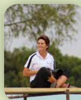
In one of the first photo's (2016) with the NSC M&M as the BSA Executive liaison.