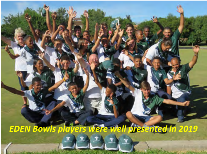
EDEN Bowls players were well presented in 2019