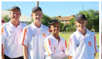
The U/20 Gold medalists, Border and U/10 Silver Medalists, Mpumalanga