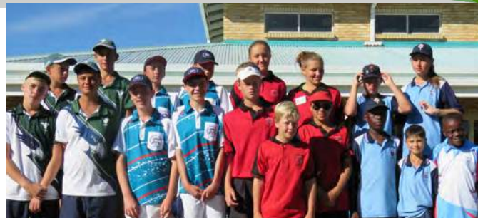
U/15 teams semi and finals—Eden, Northern Cape, KZN CB and BGN