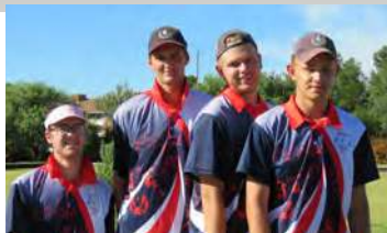
The U/20 Bronze went to the teams of Ekurhuleni and Western Province