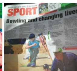
The players (left) of the Accumulo 2017 festival, the organisers and the feel good story in the newspaper.

Accumulo Consulting (Pty) Ltd was approached in 2011 to sponsor a Corporate Bowls Day for the members of the Bedfordview Bowls Club. Although the intention at the time was to stage a successful one-off event, on subsequent review Accumulo determined that there was potential to elevate the platform, and committed to continue its involvement 2012.