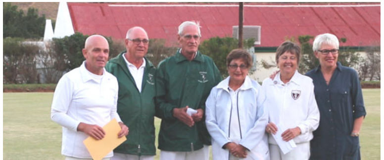
The winning team at the President's Day was Stilbaai BC.