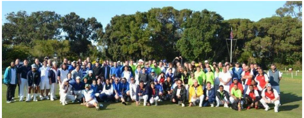
The Under 45 players at the Hermanus Bowling Club

The Super League as well as the Newbie sections played next to one another. The finals of both sections played off against each other on a slightly cold, mist covered morning in Hermanus with the teams receiving ample support from the bowls crowd with lots of excitement on and off the greens. It is no wonder that Hermanus would like to host a similar event again! The excellent play, the conduct of the players and the element of bowls "surprise" all combine for a wonderful weekend.