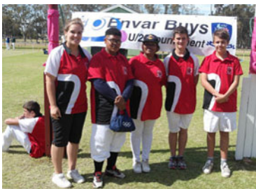
Teams and action during the U’20 Envar Buys held at the Worcester BC

Thank you to all clubs that have chosen to participate in these initiatives and thank you to each and every person that has taken the time to send feedback. Chat to your District Secretary about how you can use the M&M Toolkit to grow your club’s membership; visit www.1sport4life.co.za to add your club to the map or to see how your club compares to other clubs, and remember to follow 1Sport4Life and Bowls South Africa on Facebook and Instagram! Together we will take bowls to new heights!