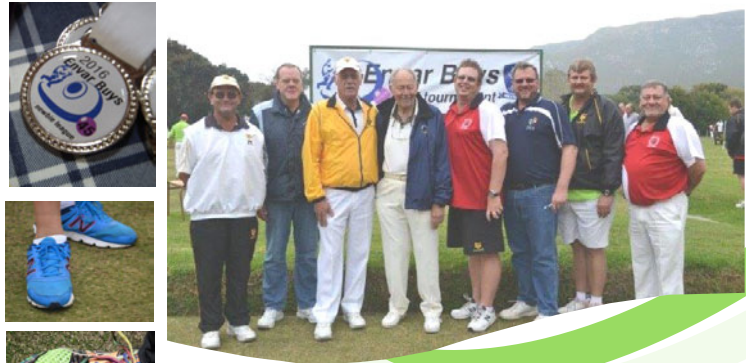
The dignitaries and spectators and some of the players during the U'45 Envar Buys tournament held at the Hermanus Bowling Club.

The Department of Culture and Sport ensured that both the players and tournament was well funded this year. This could be contributed to the fact that Western Cape Education Department has now included Lawn Bowls as a school sport which will ensure that junior tournaments will keep on growing. We are so thankful for their generous support and sponsorship!