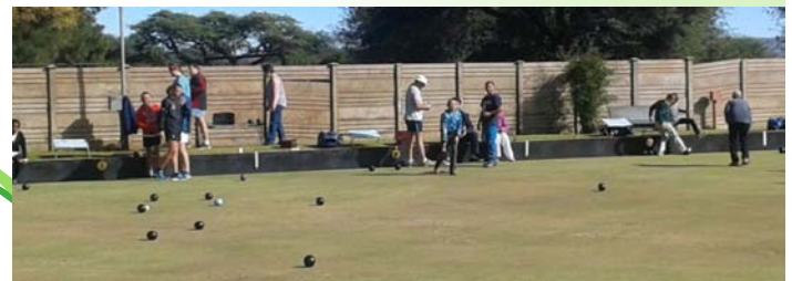
Teachers, parents and children together with club members seen during the Youth Day event at the Kuruman BC