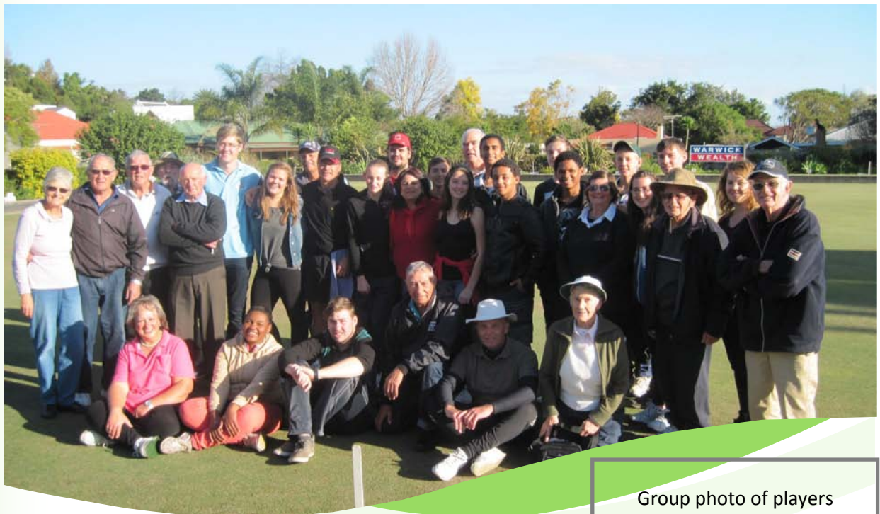
Group photo of players young and old at the Swellendam Youth Day