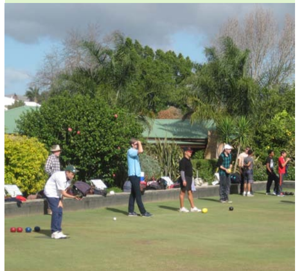
Photographs supplied by the Swellendam BC showing young and old on their greens on Youth Day