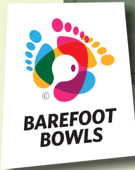
SA STYLE: Barefoot bowls is no stranger to home greens either ... as seen displayed here in Ceres