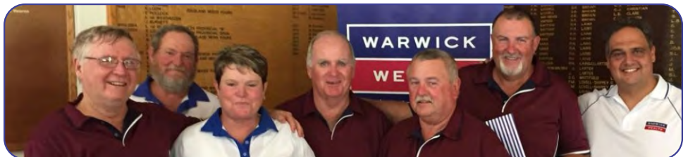
RUNNERS UP: Team Bowman