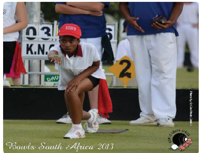
WINNER: The eyes tell it all for KZN ...

Schools development has made great strides and the number of