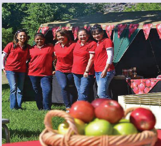
RADIANT RED: Boland youngsters strut their stuff at Ceres – harvest time, fruit and great bowls ...

In order to effectively manage discipline, clubs are recommended to call a special general meeting, or pass motions at an annual meeting to amend constitutions by adopting the clauses as set by BowlsSA here. A guide to procedures to be followed when conducting a disciplinary hearing is available on the Bowls SA website ( www.bowlsa.co.za ) under the icon Admin on the home page.