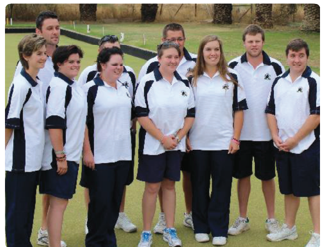
YOUNG TALENT: The successful SA Juniors side in Namibia

young bowlers has grown unbelievably. Proof of their progress might be measured by the manner in which a Junior Protea (Under-25) side dented the pride of their illustrious South African, Namibian and Zimbabwean full internationals at an inaugural Quadrangular Tournament held in Namibia. SA's U-19 players, some as young as eight, from urban and platteland pods, show