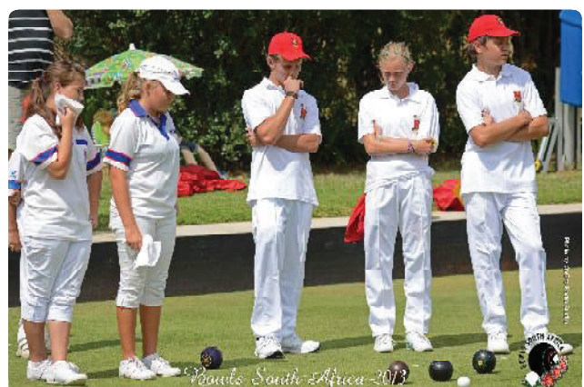
YOUNGER STILL: "Bowls Babes" perpetuating the code