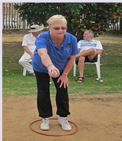
ALLEZ: Les Hurlbatt playing at the Club de Pétanque, Durban

The origins of pétanque, otherwise known as boules, are lost in the mists of time, but what is known is that two balls and a jack were found in the sarcophagus of an ancient Egyptian prince.