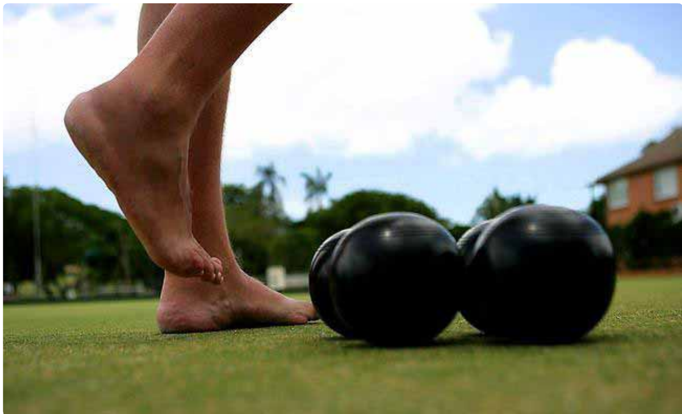
BAREFOOT BOWLS DOWN UNDER.