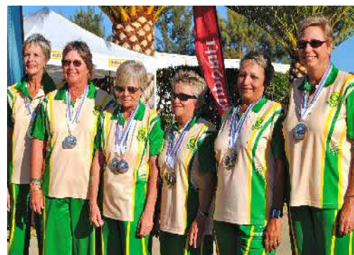
TOP GIRLS: The Protea women ended top overall