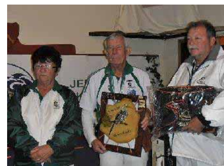
THE SPOILS: Prizewinners at the Nomads Nationals collect their items