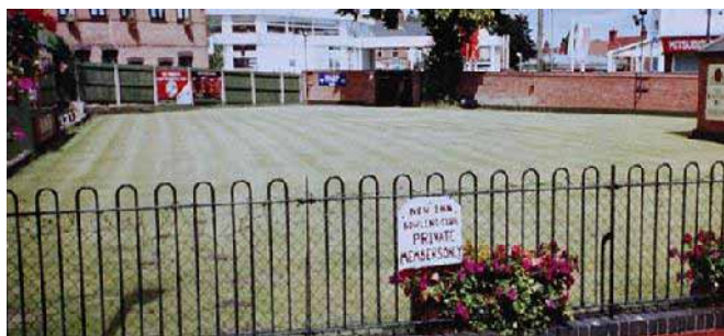
OUT!: The 35 members of the bowling club have been banned from playing on their plush green,

It's the oldest bowling club in Birmingham, whose members have an average age somewhere between the mid to late-60s; teams have played four times a week since it opened in the 1870s.