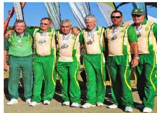
FOUR GOLDS: SA's men; triumphant throughout